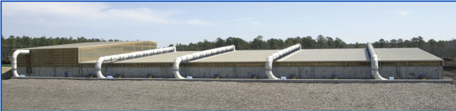
McGill-Waverly is the largest enclosed composting facility in Virginia. In the foreground is the biofilter, designed to remove odors and particulates from process air.

McGill Environmental Systems is a compost manufacturer specializing in the management of compostable by-products and residuals from municipalities, industries, and agribusinesses, offering a full range of services, including transportation and marketing. It has been building and operating large regional facilities since 1990. All McGill manufacturing plants are indoor operations and weather independent, providing services 365/24/7.