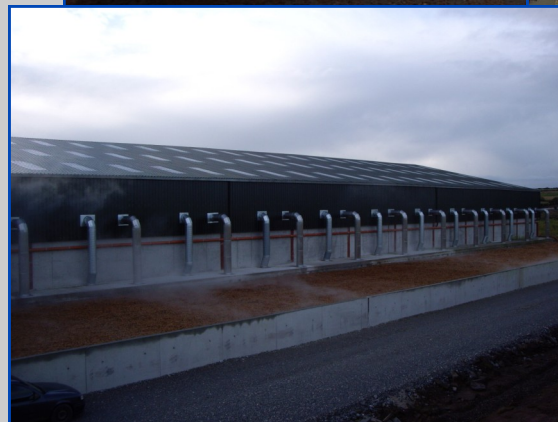
CLOCKWISE FROM TOP: 1 - McGill enclosed bay system 2 - Process control panel 3 - Biofilter