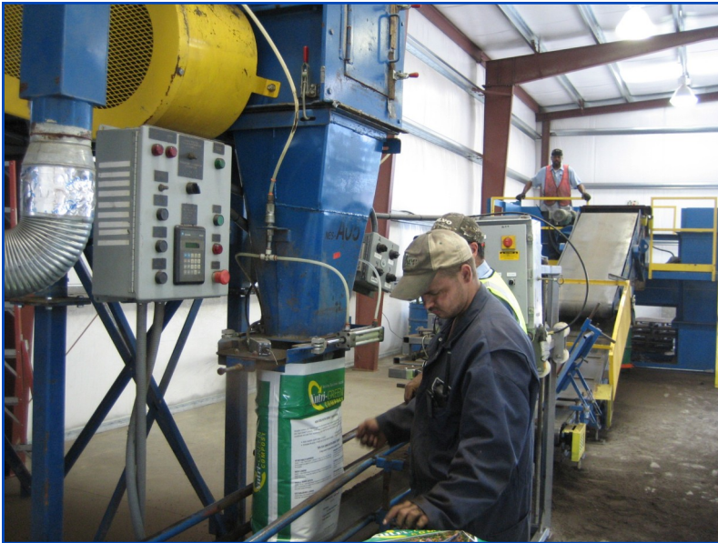
Bagging at McGill's Waverly, VA, facility.

and gypsum products. Agricultural by-products include such materials as sweepings, animal manures and bedding materials, tobacco dust, and cotton gin trash waste.