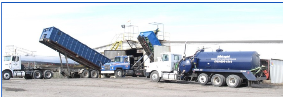
Trucks unload at McGill-Merry Oaks. Incorporating a wide variety of materials as compost feedstocks results in a more complete final product.

McGill facilities accept and process non-hazardous municipal and industrial biosolids and sludge; water treatment residuals, "woody" materials such as sawdust and wood chips;