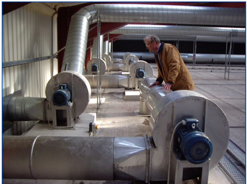
Inspecting components of the aeration system atop a bank of enclosed bays, McGill's most recent process enhancement.