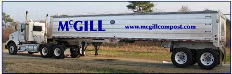
The McGill transportation fleet includes tankers, trailers, and roll-off boxes. Service is offered 365/24/7.

During almost 20 years in composting, McGill has earned an unsurpassed record of sustained, reliable, cost-effective service to its customers. Many have used McGill transportation and composting services for over ten years. Currently, it provides organics management services to about 235 municipalities and industrial operations in North Carolina, South Carolina, Virginia, and the District of Columbia.